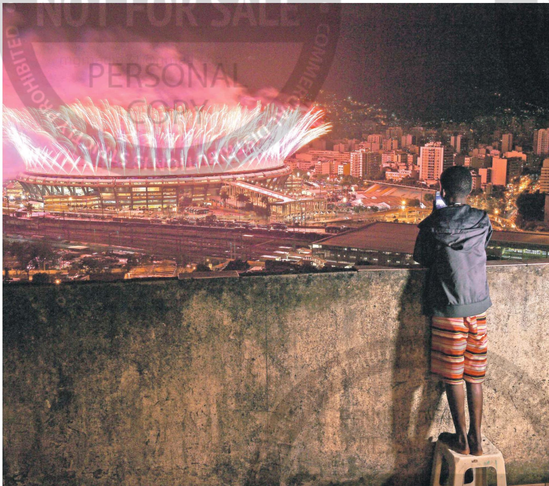
A boy from Mangueira favela watches fireworks explode over Maracana Stadium during the closing ceremony of the Rio Olympics on Aug. 21.