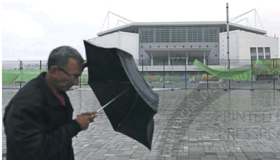
With heavy rain beating down, a man walks through the Olympic Park a day after the closing ceremony of the Rio 2016 Olympic Games.