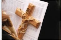
A crucifix is held during a Way of the Cross procession in New York City, A...

Catholic numbers in Brazil strongly declined among all classes in recent years, according to a study released as Rio de Janeiro is slated to host the Catholic World Youth Day in July 2013.