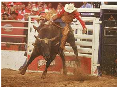
Cowboy Festival, in Barretos, São Paulo attracts lots of tourists