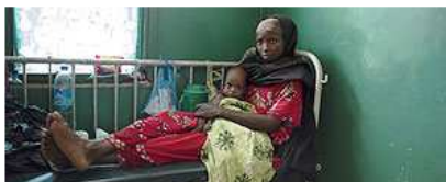
Folha's photographer shows the faces behind humanitarian crisis in Somalia