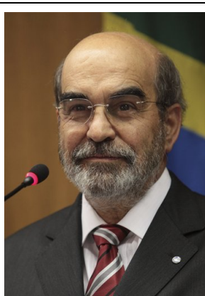
In this picture taken Aug. 3, 2011, Jose Graziano da Silva, the new Director-General of the UN Food and Agriculture Organization (FAO), reacts during a news conference at Itamaraty palace in Brasilia, Brazil. Graziano, a former Brazilian food security minister, is one of the creators of the nation's "Zero Hunger" social programs which includes "Bolsa Familia" or "Family Grant", the biggest program that gives money directly to poor households. That same idea may now get a global tryout as world food prices spike, economies everywhere sputter and a horrific famine desolates East Africa. ?

Graziano helped create the Zero Hunger program but was removed from his post as the minister in charge of it after a year amid complaints about a lackluster start. He remained an adviser to Brazilian President Luiz Inacio Lula da Silva and in 2006 became Latin America's top representative at the FAO before being elected to replace Jacques Diouf of Senegal as head of the U.N. agency. He assumes the post Jan. 1.