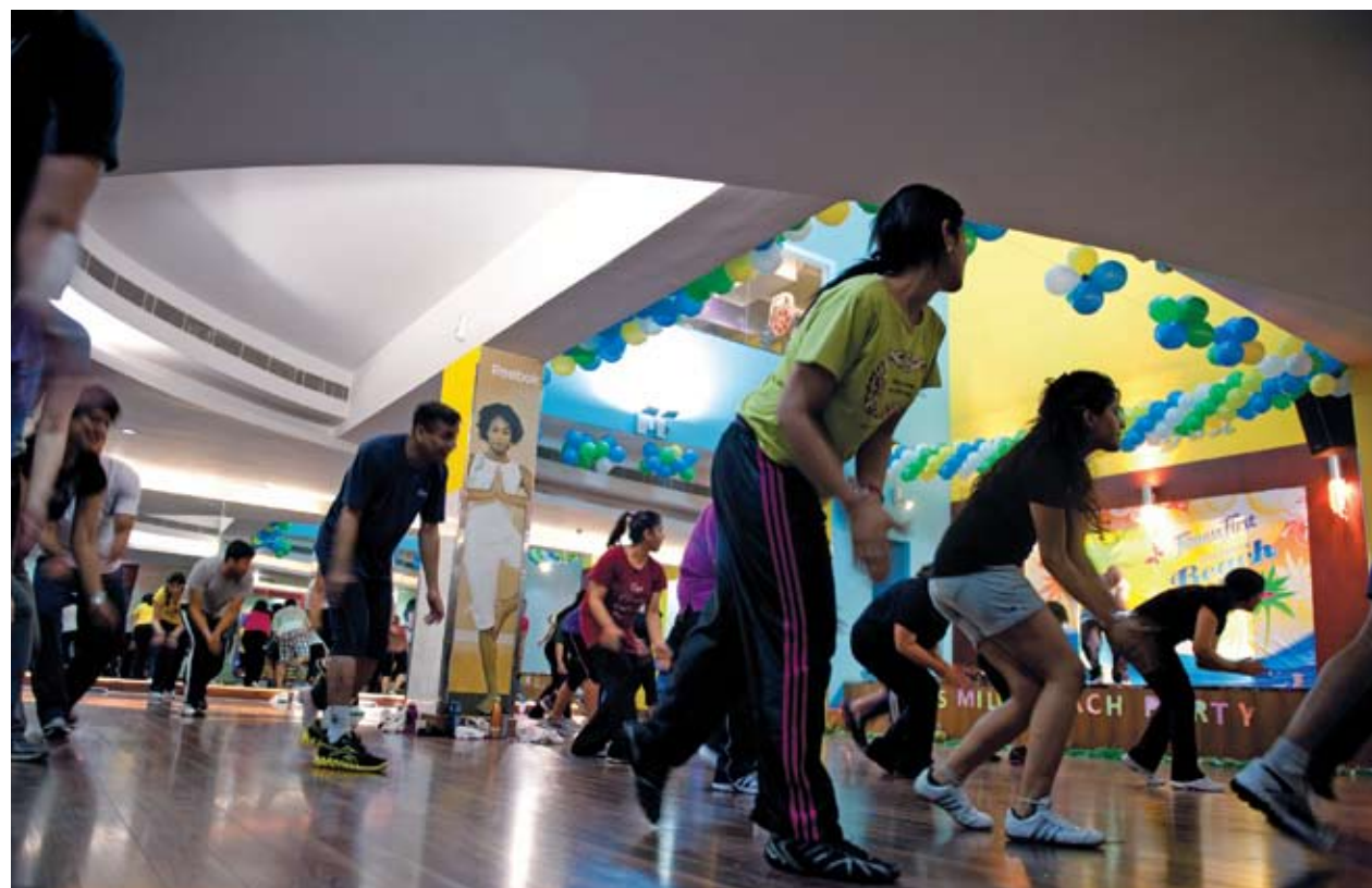
After work, middle-class Indians fill a dance class at a gym in Delhi.