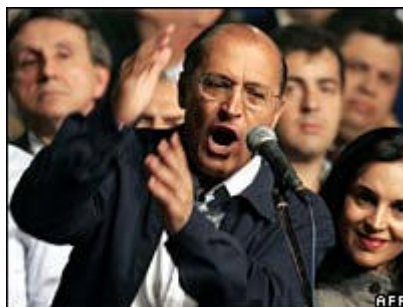
Mr Alckmin's best hope is to force the president to a second round

However, as he faces the voters the president still has huge advantages. Crucially, he can boast that Brazilians are becoming better off. Recently released figures show a rise in average incomes and falling levels of poverty.