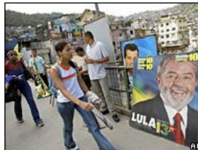
Economic growth has helped to keep voters on Lula's side

Not surprisingly, the affair has given renewed hope to the opposition. Mr Alckmin's campaign is demanding to know the origins of the $800,000, while the far-left presidential candidate, Heloisa Helena (Socialism and Liberty Party,