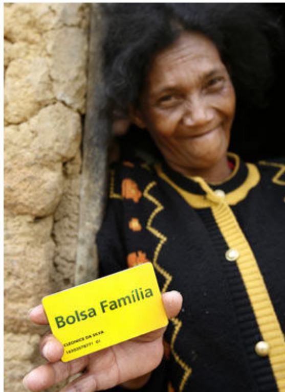
The Family Fund has worked